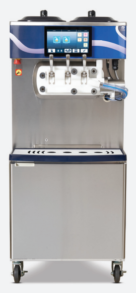
NA6888 DUO CHAMPION COMBI